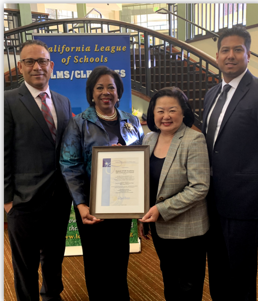
Haskell Middle School