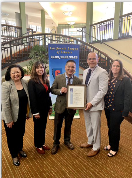
Carmenita Middle School