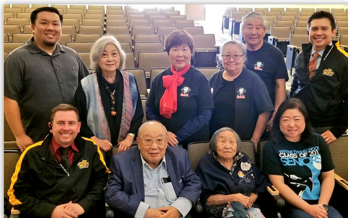
Day of Remembrance at Whitney High School