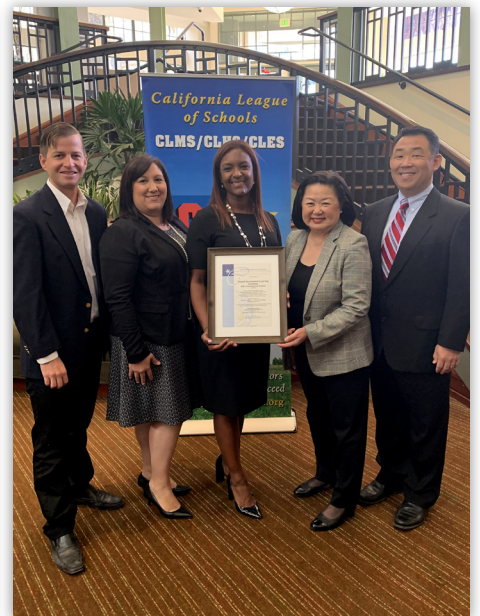
Terzclaff Middle School